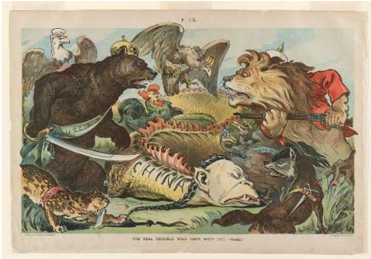
Political cartoon: “The real trouble will come with the wake” (Puck, Aug 1900)

And that’s not the only contender; the Lion of Judah has long served as a symbol of the Jewish people.