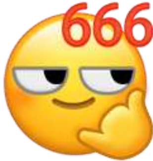
Chinese 666 emoji

Just as “6” is pronounced “six” in English, it has its own Chinese language pronunciation: “liu.” (That approximately rhymes with “mew.”)