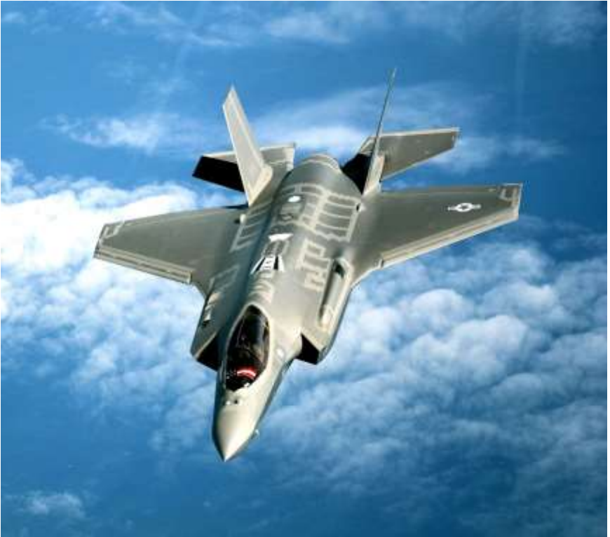
F-35A prepares for refueling

The F-35 Joint Strike Fighter will play a central role in all 21 st century deterrence and combat. It has become the new common denominator in joint force exercises between the U.S. and its allies, allowing closer teamwork between nations, and will be receiving engine upgrades to increase range and performance.