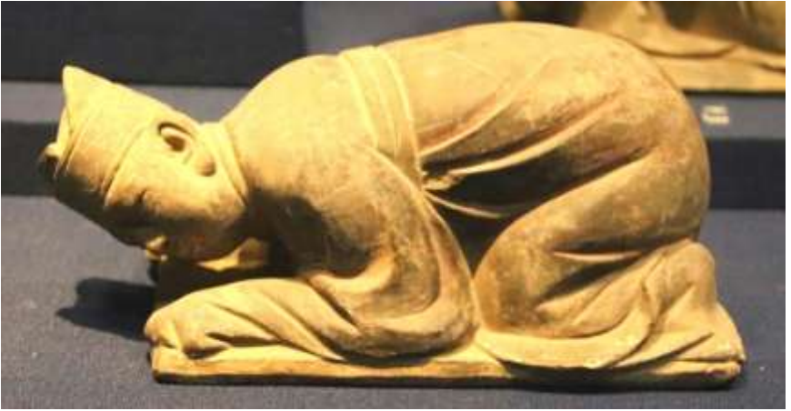
"Kowtowing Official" (China, Song Dynasty) [Don't be like this guy!]

Yes, Chinese culture before Communism is an interesting study, as is the language.