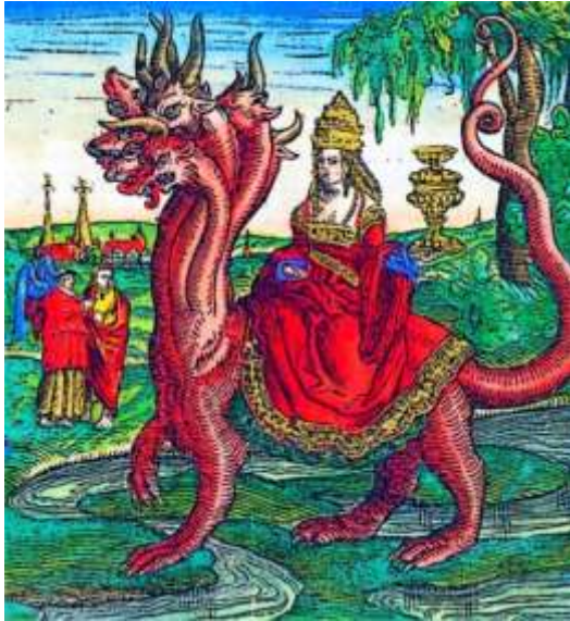
Babylon Riding a Beast (Luther Bible, 1534)

Are you ready to understand the Word, overcome the Beast, and prepare yourself for the return of Jesus? Let's get started!