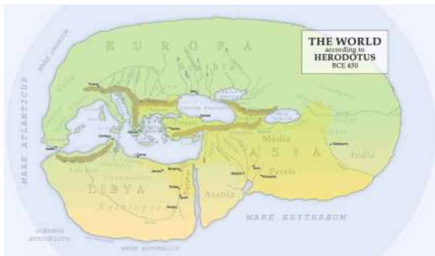
Approximation of the known world in Greek times

Jewish prophets sometimes referred to these familiar civilized connected regions as the Earth, while other lands (some requiring a substantial ocean journey) were called the Sea.