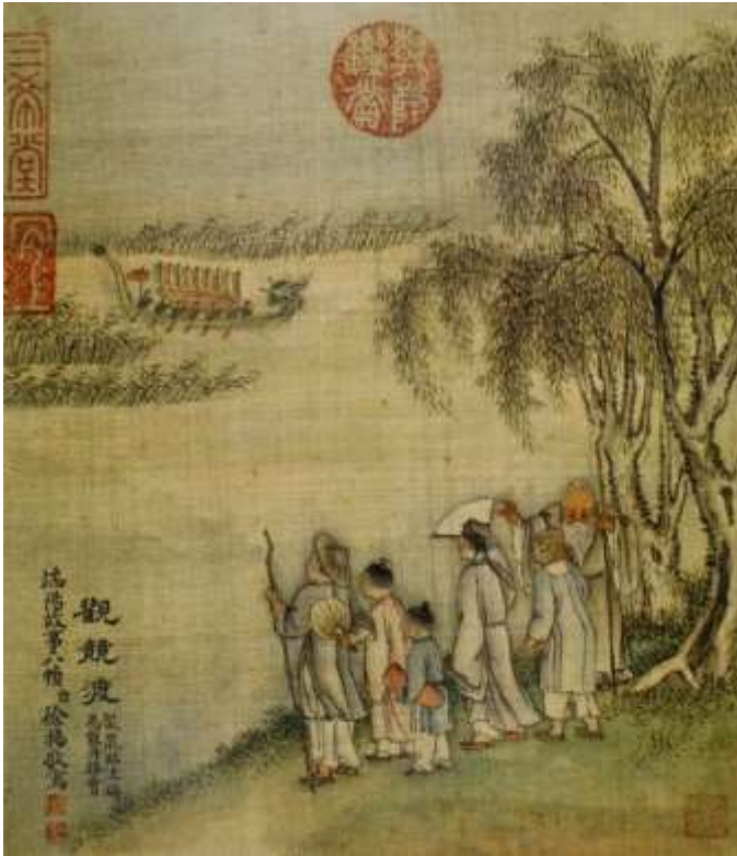
"Crowd gathers at the river to watch dragon boat racing" (Qing dynasty, Xu Y.)

But would China's characteristics qualify it as part of this Beast?