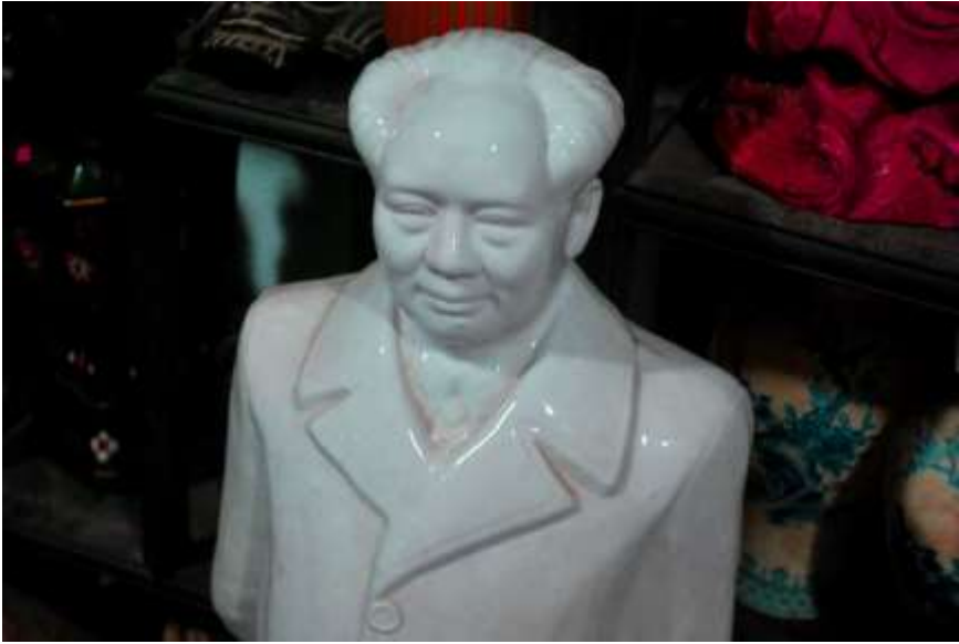
Mao ceramic devotional figurine

To be Number One, Xi must excel all others past and present.