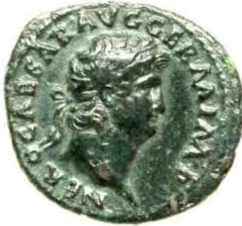
"NERO CAESAR AVG GERM IMP" (Roman Bronze Coin, 66 AD)

Nero is the most famous example. He brutally persecuted the early church, and it's well-known that NERO CAESAR also could be transcribed as NERON CAESAR to fit both 666 and 616 in Hebrew Gematria.