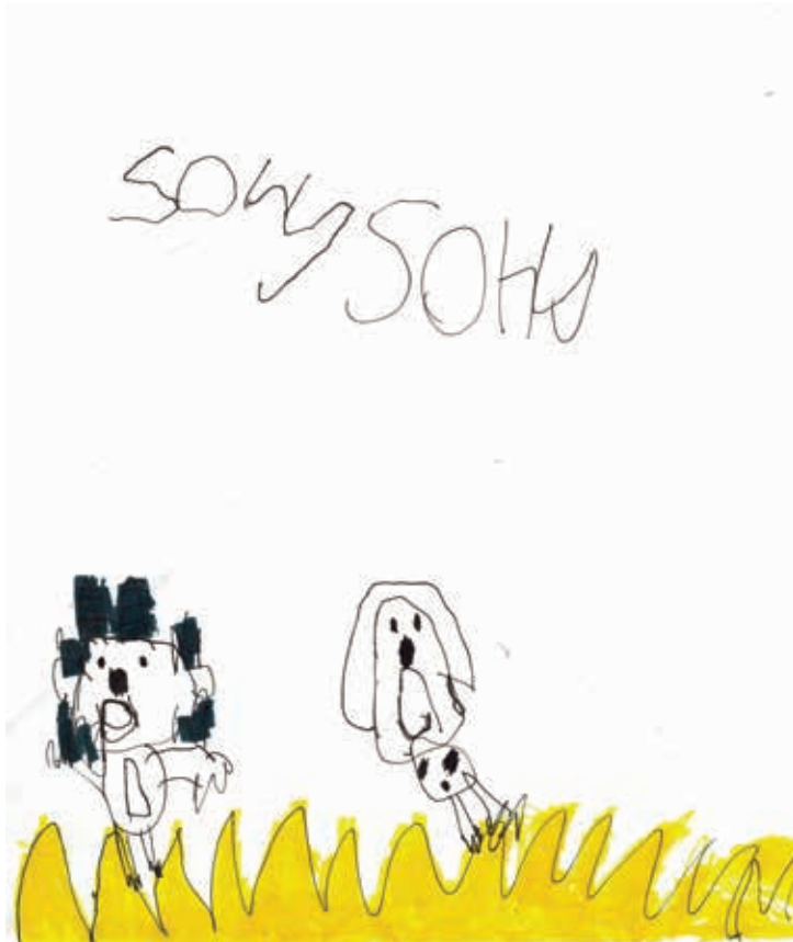
“Hell” by Deepika (People saying ‘sorry’ from the fire of hell)