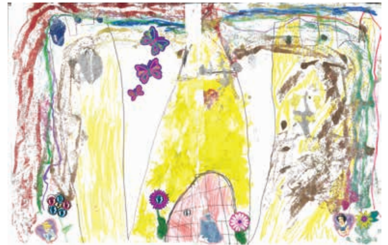
"Heaven" by Deepika (People looked like princes and princesses)