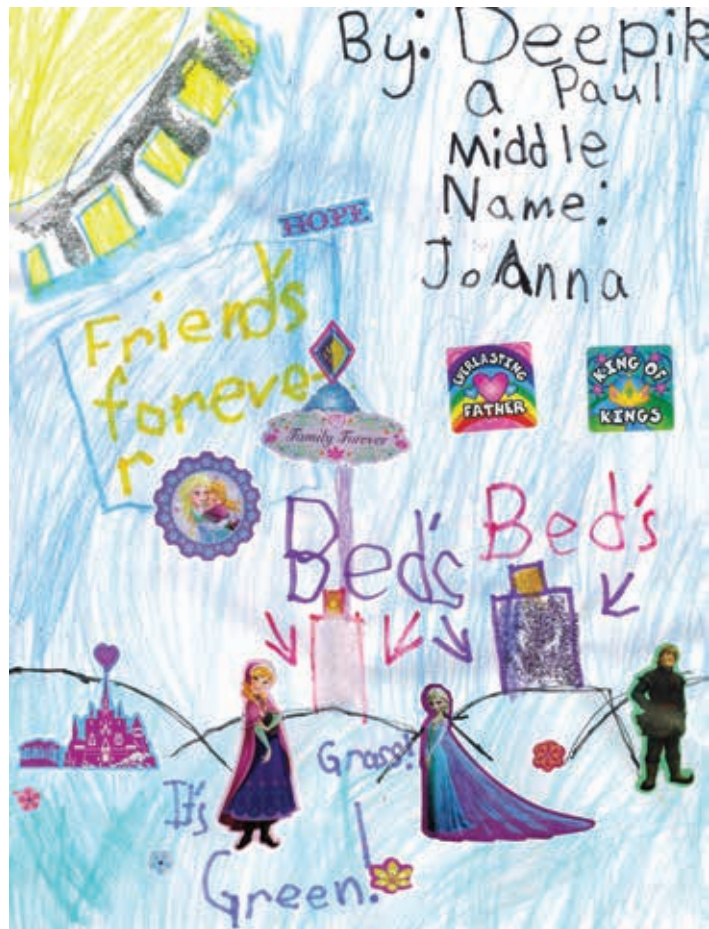
“Beds in heaven” by Deepika (Priyanka’s pink bed and Deepika’s purple bed)